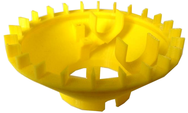
Fig. 1. Adapter part

the robot chassis. Speed of the robot can be controlled by PWM (Pulse Width Modulation) outputs of the Arduino board connected directly to the DRV8835 board. The robot has six TCRT5000 reflective optical sensors which allow to sense distance up to 5 cm. They are connected to an ATtiny84 microcontroller which processes data from the sensors and communicates with the Arduino board. Figure 2 shows the assembled final robot.